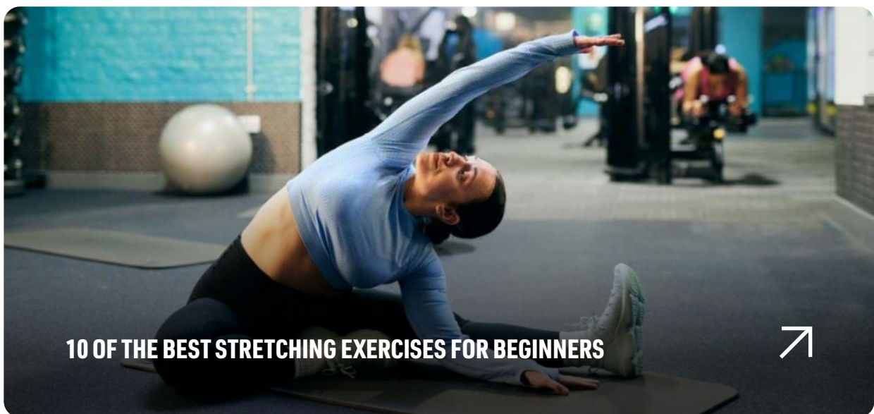
10 OF THE BEST STRETCHING EXERCISES FOR BEGINNERS