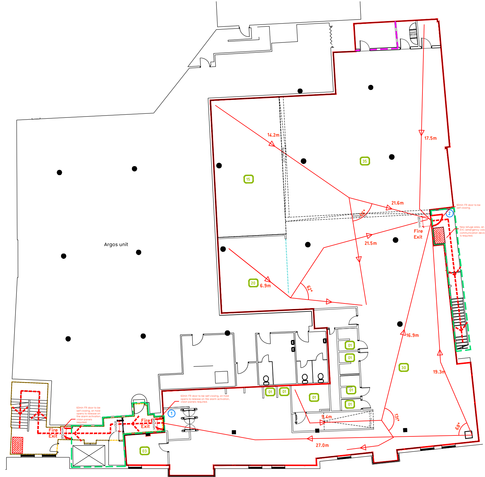
Proposed First Floor Plan (Scale 1:100)